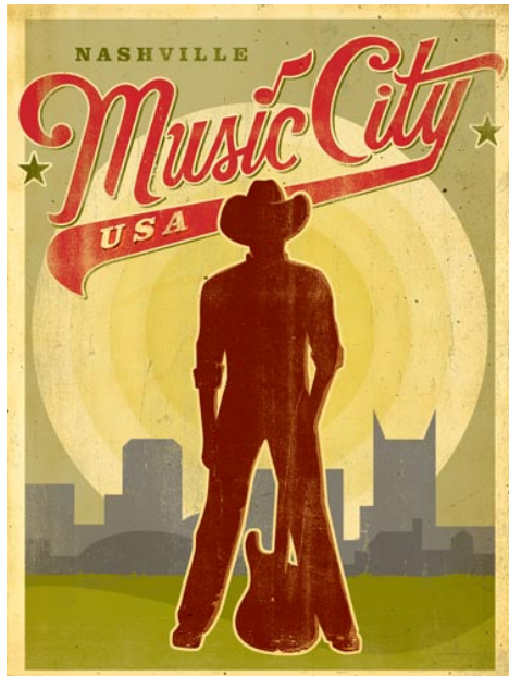
© 2007 Anderson Design Group & Spirit of Nashville. The "Music City Man" image is used by permission.